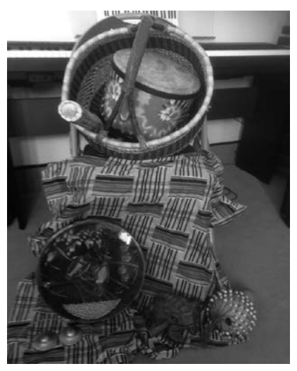
FIGURE 5 Example of a basket of intruments

Teachers were directly involved in the decisions about purchasing a range of instruments for use in the classroom recommended by therapists. The quality and range of instruments was essential to ensure that young people enjoyed engaging in playing at a sensory level. Training sessions showed that it was most manageable to provide instruments in a basket for each classroom. This allowed the opening and closing of the activity to work naturally as instruments would be put back in to end. The baskets included information cards about different instruments with cultural details.