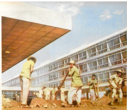
A CATEDRAL DO PARANÁ SE ENTRA A PODEROSOS MINUTOS DE BRASÍLIA. O RIO VAZ SE REFEZENDO, PARA FORNITECER ENERGIA. A CATEDRAL E O LUGAR DE TURISMO