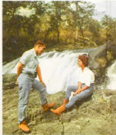
o HOTEL DE TURISMO JÁ SEBÁ FUNDACIONADO: PROJEÇÃO E APARTAMENTOS DE LUGAR.