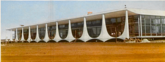
o PALÁCIO DA ANTONINA SEBÁ LOCALIZADO NA PONTA DO SEME, BANDO AS COSTAS PARA O IMPENSO LAÇO QUE CIRCUNDA O PLANO:PRÉDIO: SE PRÉDIO, POR SE TER A PRAÇA DOS TRÊS PODÊRES E ATE ONDE A VISTA ALICANCA, E UM ESPÉCULO.

When the first buildings were completed in 1958 the ever-present red dust became a threat to the architecture itself, dirtying the buildings' whiteness and proper appearance. If the white wall was associated with modern architecture, and order and hygiene, red dust was anti-modern, chaotic and dirty. With red dust covering its surfaces, Brasília failed to live up to its ambitions of being a symbol of modernity, taming Brazil's central plateau. The dust complicated the clear distinction that Brasília aimed to achieve between architecture and nature, between civilization and wilderness, order and disorder.