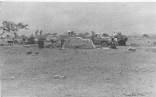
• A primeira descarga de cimento em Brasília.