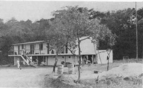
• Um palácio provisório de madeira edificado, por iniciativa de amigos do Sr. Presidente da República, em pouco mais de dez dias.

H OMENS, máquinas, entusiasmo, ação. E Brasília é uma idéia que se concretiza, um empreendimento que avança em ritmo acelerado.