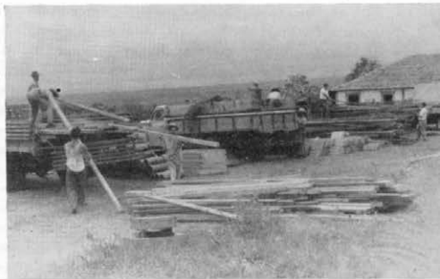
• Materiais que em breve se transformarão em edificações e benfeitorias.