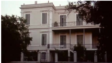
[Fig. 15] Theo Angelopoulos, The Emanuel Salem, film still, Eternity and a Day , Thessaloniki, 1998