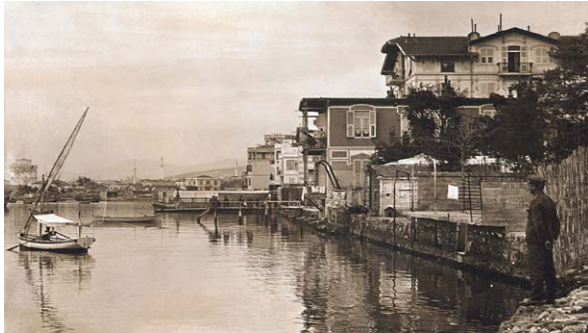
[Fig. 1] Villas on the waterfront, Thessaloniki, 1915-1917