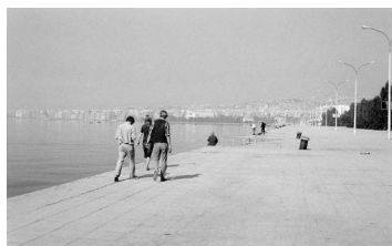
[Fig.11-12] Yannis Stylianou, Thessaloniki, 1960s; © Yannis Stylianou Archive/ MOMus-Museum of Photography Thessaloniki