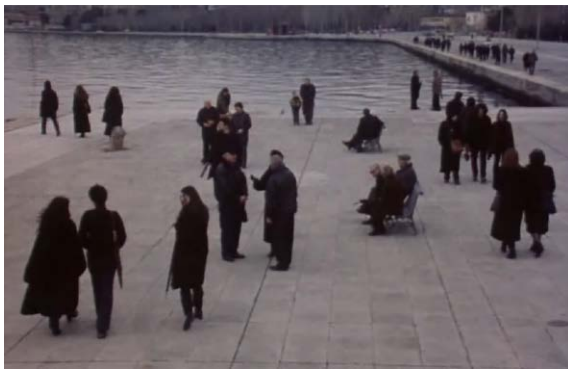
[Fig. 16-17] Theo Angelopoulos, Film stills, Eternity and a Day , Thessaloniki, 1998