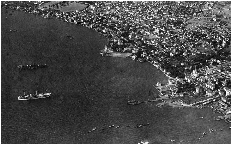
[Fig. 2] Ch. Denti, The natural waterfront, Thessaloniki, 1916