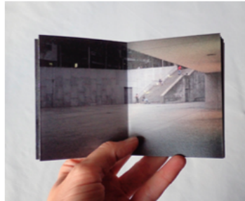
ANA MIRIAM Clareira: Anoitecer", 2018

Images are revealed as the paper is unfolded, in one case simultaneously and in the other in a sequence of three moments. Ciclo focuses on the seasonal changes of a group of trees, placed at the center of the space. It is bound only by a ring, around which individual images are turned, having no beginning or end.