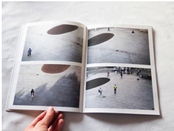
ANA MIRIAM Spreads from: "Clareira: Estar, Não Estar, Passar", 2018

Three small elements are accordion bound, offering different folding possibilities that allow the reader to associate images freely. The object can also be fully extended, or spreads can be observed individually. Noite and Anotecer were shot in low light conditions, one during the night and the other at twilight. In these cases, accordion binding favours the merging of images into each other.