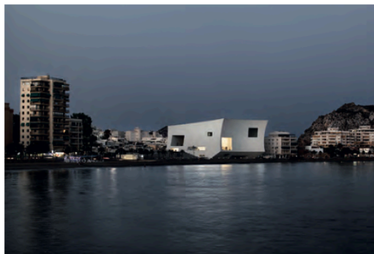
MARIELA APOLLONIO Aguilas 3

The current state of play in architectural photography is the image mechanism at its peak. The mass media dominates architectural projects, architects and the way of displaying or photographing them. The architectural photographer has become a producer of advertising images to enhance the photographic appeal of the building, not necessarily its complexity or significance. Architectural photography, following in the steps of computer rendering, has created a world of simulations inherent to it. It has turned into a 'different' architecture with which the architecture of phenomena and materiality cannot compete. Does the image mechanism represent the cultural value that we want to project of architecture today? Would it be possible to consider an architectural photograph beyond the bounds of this inherited system?