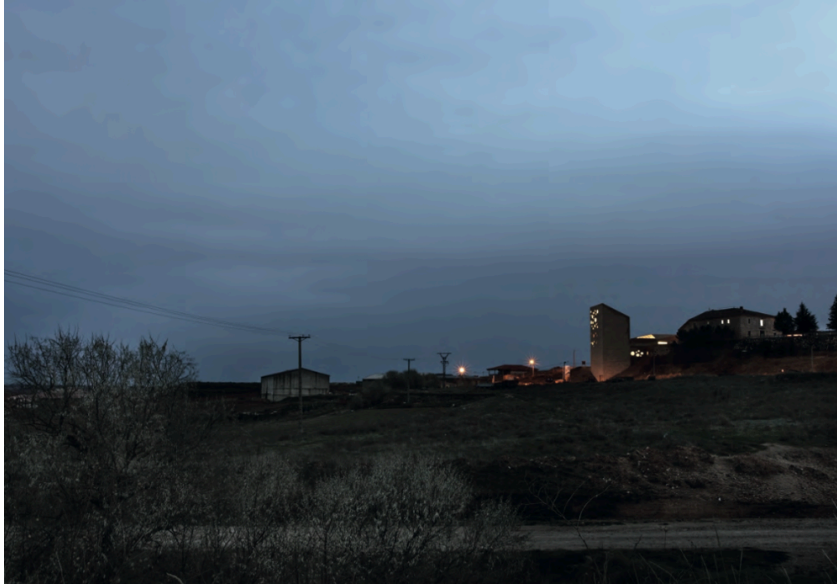
Ribera del Duero Headquarters Roa, Spain. Barozzi Veiga Architects, 2010