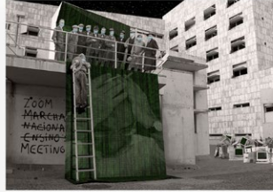
Honourable mention (2023) to "A Wake-Up Call" by Inês Nascimento