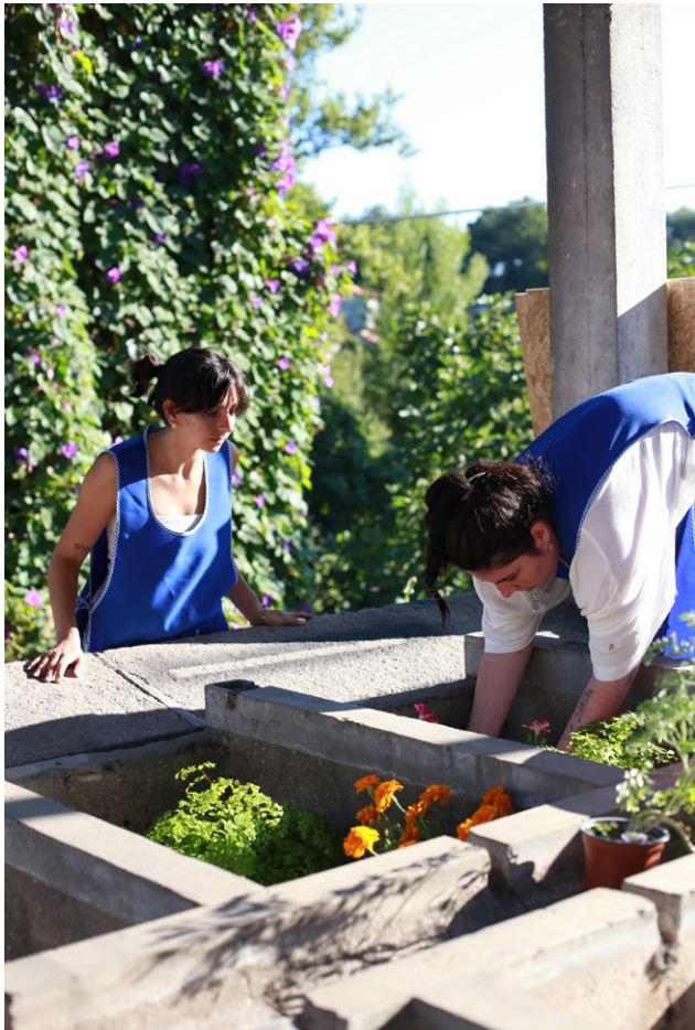
Rite of the Waters: procession through the Campanhã Washhouses, Act III, Granja, 2023.