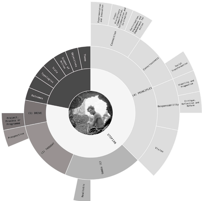
Fig. 2 Diagram of the SAAL case study through the Utopian Lens. (Source: Author).

certain it is that it will forever remain just out of reach". 65 However, utopia – an oxymoron by nature – surfaces emancipatory aspirations that require realization in the present, 66 while radical pedagogy, also an oxymoron, can be perceived as a transitional phase that needs renovation. 67 Much like utopia, radical pedagogies are always putting the horizon line one step further.